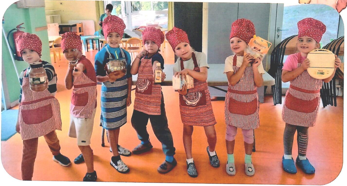
Making crumble pie and apple cakes.