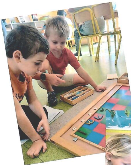
At work in class