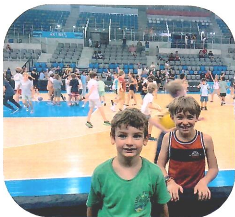
Sharks match evening