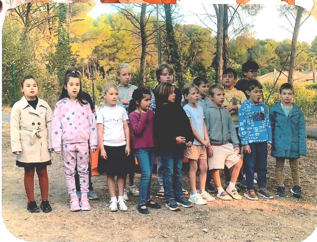
Parents breakfast. Children songs